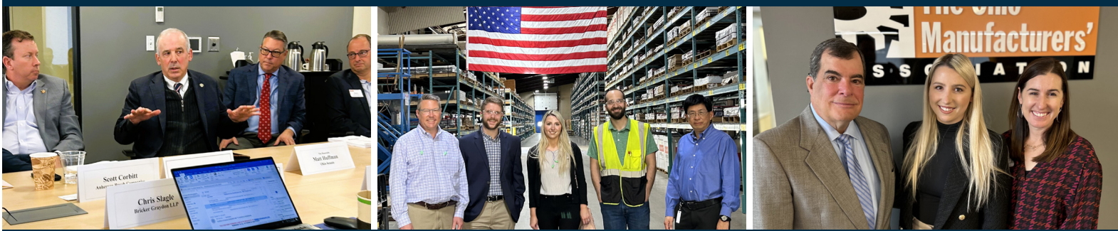
Left: Ohio Senate President Matt Huffman addresses manufacturers at a recent OMA Government Affairs Committee meeting.