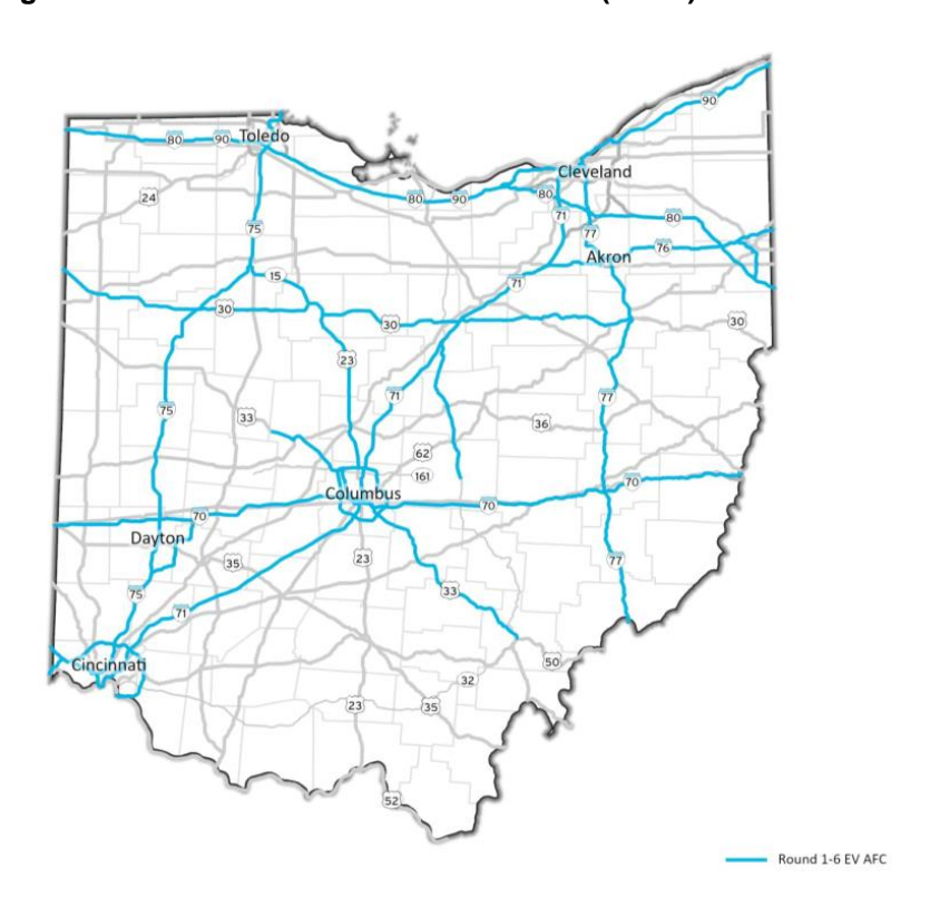
Figure 1: Ohio's Alternative Fuel Corridors (AFCs)<sup>4</sup>