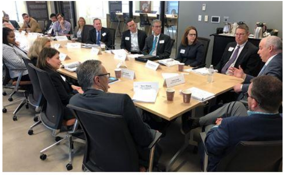
State Sen. Matt Huffman (upper right) addresses OMA members at this week's Government Affairs Committee meeting.

The next Government Affairs Committee meeting is set for Wednesday, June 3 in Columbus. 3/5/2020