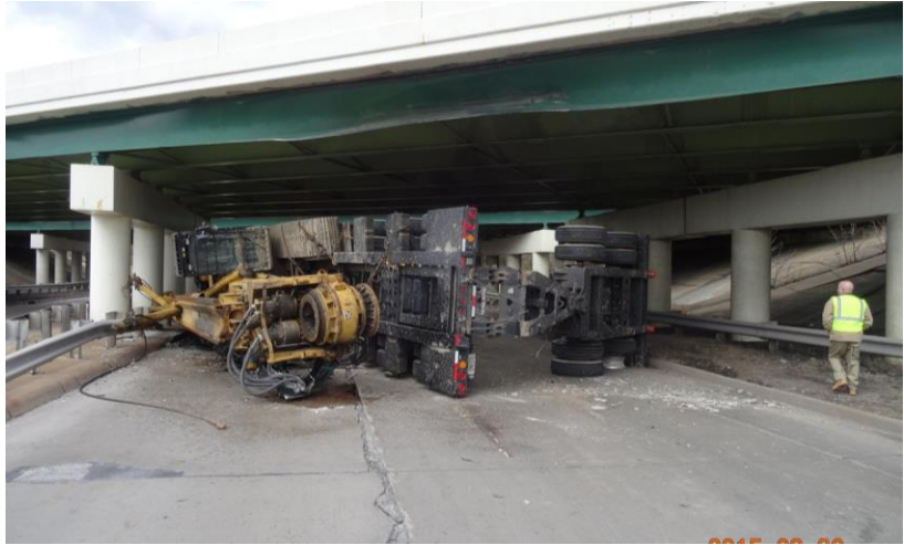
19 | Ohio Manufacturers Association November Meeting