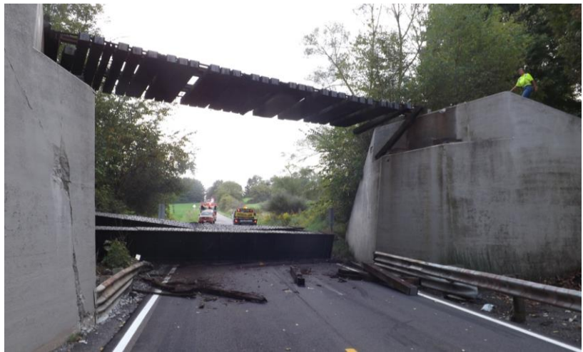
20 | Ohio Manufacturers Association November Meeting